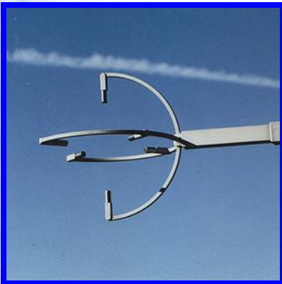
"Vx" Style Probe

A non-orthogonal design for applications that require a high range of velocity.