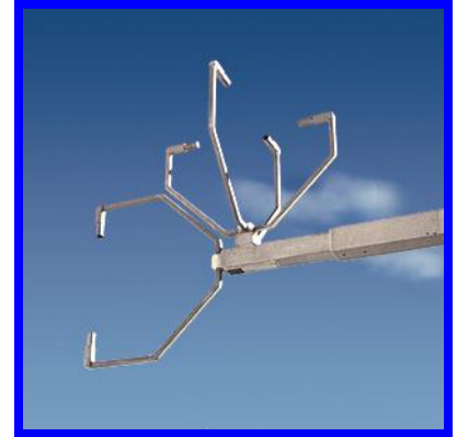
"Sx" Style Probe

Designed primarily for atmospheric boundary layer studies, but suited to a broad range of wind sensing applications. Array design assures minimum flow distortion errors in measured turbulence statistics.