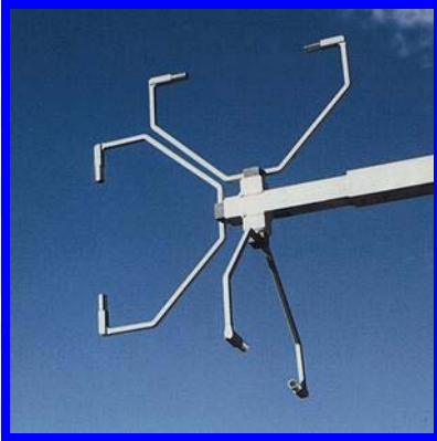
"K" Style Probe

Designed primarily for atmospheric boundary layer studies, but suited to a broad range of wind sensing applications. Array design assures minimum flow distortion errors in measured turbulence statistics.